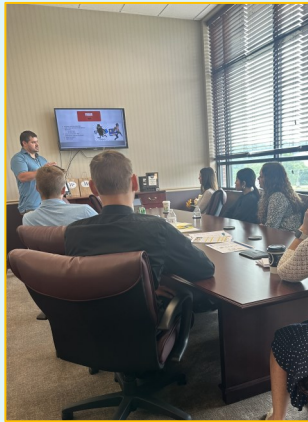
Intern Orientation Day at Meadows Landing.

Business will resume at Big Mac Banking with the start of the 2023 school year. The Student Branch, located inside Canon-McMillan High School, will be staffed by Credit Union employees and a new crew of Student Credit Union Club Members! Many of the Club Members completed internships at the Meadows Landing office this Summer. Their working hours were spent training behind the teller line and planning promotional events for the Student Branch. We are proud of this partnership and look forward to serving Canon-McMillan students, staff, and families!