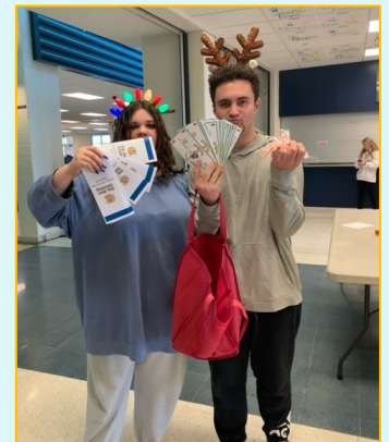
Holiday festivities at the Student Branch!